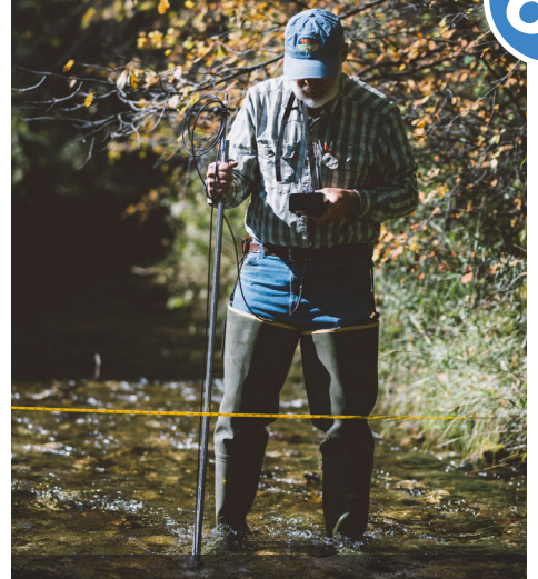
Measuring canal flows to quantify recharge

Market payments incentivize farmers to manage water for ecosystem benefits