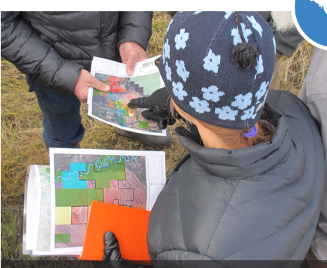
Partners plan protections for migrating sandhill cranes