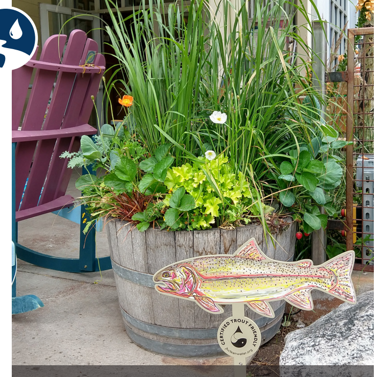
A Trout Friendly Lawn sign displayed at Snake River Brewing